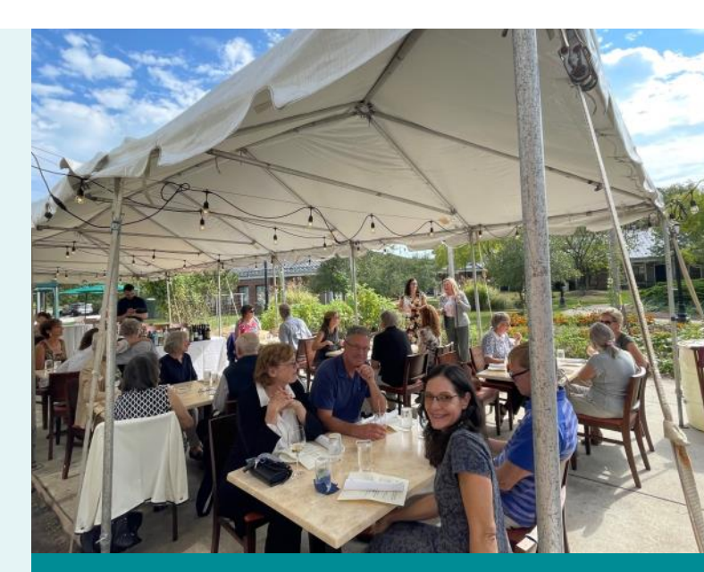
Conservation Champions enjoying our first land conservation luncheon at Café Mezzanotte in Severna Park in October 2021.